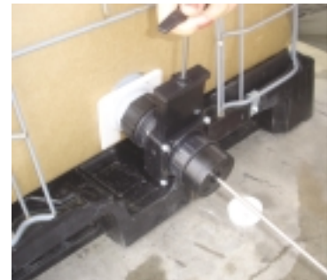
Reusable valve and cutter